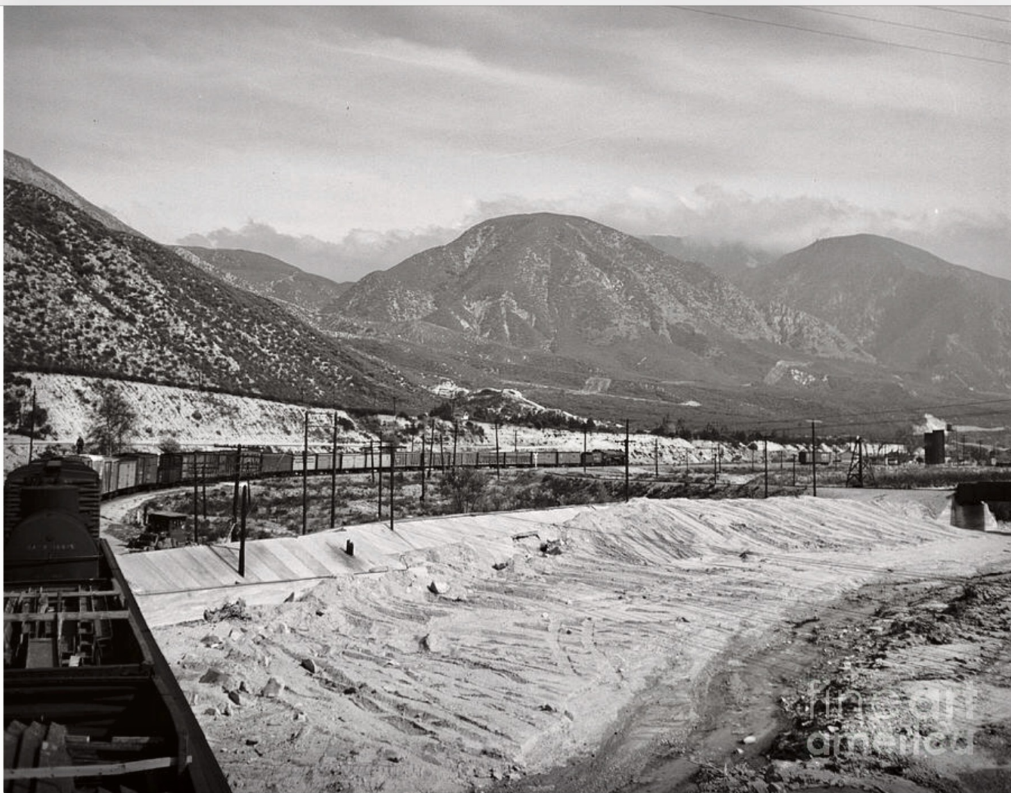
Delano Photo (1944)? Shows another view of the wall between bridges with dirt apparently recently bulldozed.