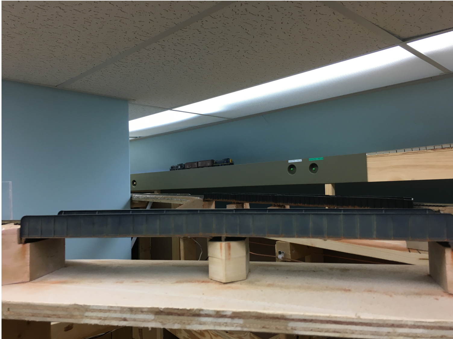
Mike Davis's model of the bridge using Monroe Models /AIM 556 abutments and pier, with ME 75-520 girders, and a hard board deck. Custom abutments could match the prototype.