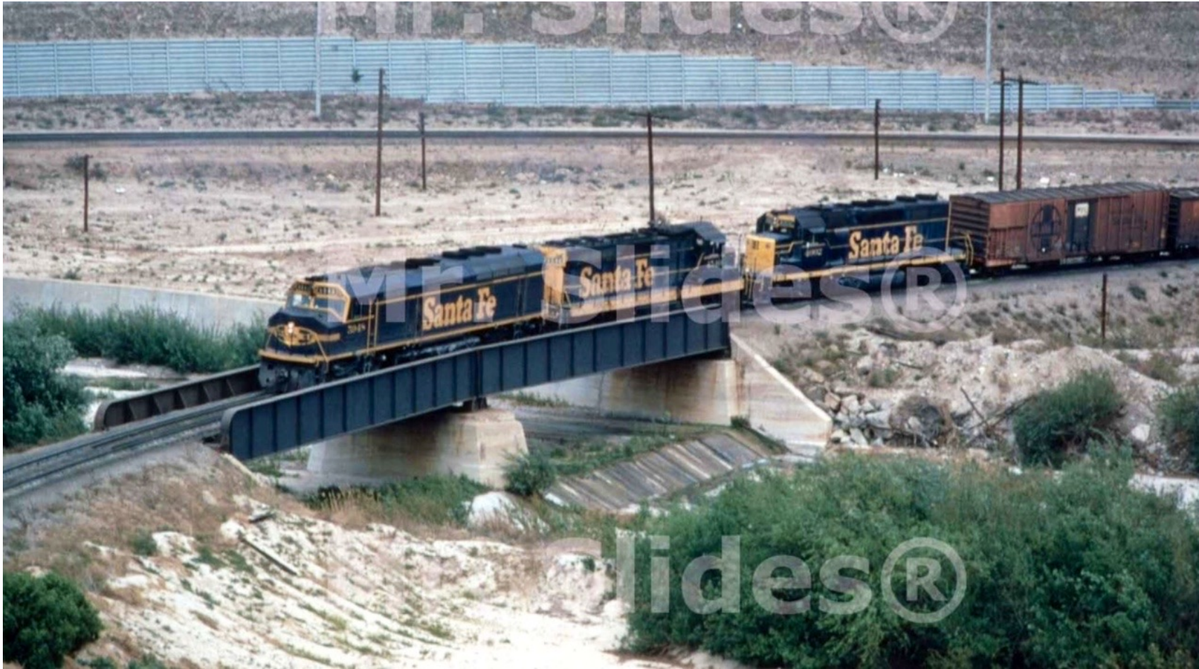
A good photo of the western abutment