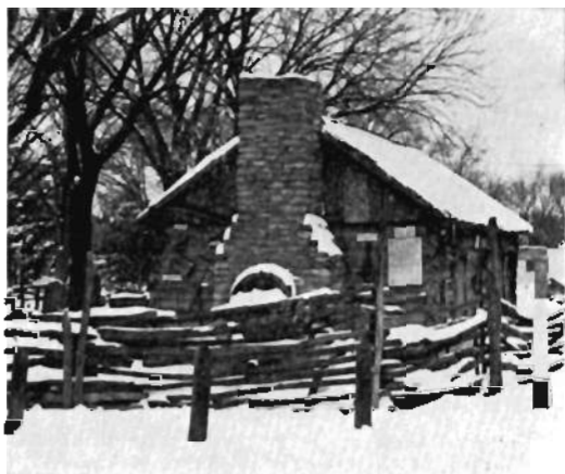
Replica of an early-day settler's cabin. Furnished with genuine pioneer relics, this cabin in Gage Park at Topeka attracts many visitors.

"They settled here," Indians explained, "because the land was flat. They flew at such great speed that they needed level runways for landing. When the Jayhawks first came to the plains, all the country was a desert, without water or vegetation, and even without wind. For many moons whenever a Jayhawk wanted a drink he had to fly to the Great Lakes. One hot summer day several million Jayhawks started northeast for water at the same time. The tremendous force of their flight started a strong breeze from the southwest. From that day the wind has never