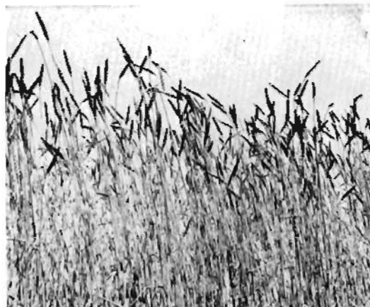
Wheat—grain of Kansas—Staff of mankind.

ceased. Since it blew the first clouds across the plains Indians always credited the Jayhawk with bringing rain and vegetation to Kansas