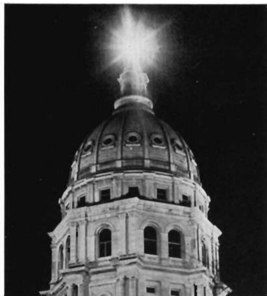
Night scene of the dome atop Kansas' State capitol building.

Among the minerals referred to by Mr. Babson, oil, gas, coal, salt, zinc and lead, stone, cement, sand and clay are produced in large volume. Asphalt rock, gypsum, chalk, pyrites, rock wool, helium, carbon black, volcanic ash, bentonite and diatomaceous marl are being commercially produced or are available for production. Present annual mineral output is five times that of Alaska and exceeds the famous mining states of the Rocky Mountains.