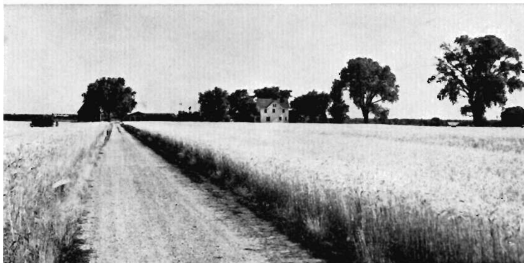
This prosperous Kansas farm home is surrounded by golden wheat fields. It is typical of central and eastern Kansas.

Cattle-poor Texans trailed their herds to newly-laid rails in Kansas and returned with tools and supplies to rebuild their war-racked state. The rails crept to and through the Rocky Mountains and on to California. Far-flung settlements of the nation were drawn together through channels of commerce and Kansas was on the main line.