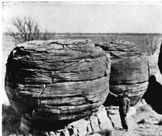
At Rock City in Ottawa County are 50 of these unique spherical rock formations some 12 feet in diameter. Kansas humorists have suggested these rocks were petrified eggs of the mythical Jayhawk.

"Now that I wish to describe the appearance of these birds it is to be noticed that no two of our soldiers found it possible to agree in any particular. As it seemed to me, they