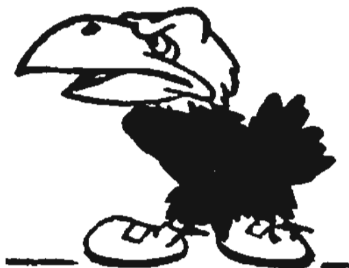
The Jayhawk—a Bird?

Cyrus K. Holliday and others realized this and in 1859 the group met in Atchison to organize the Santa Fe railroad company, with the idea of developing latent richness of Kansas and the Southwest. It was in the fall of 1869 before the railroad actually was in operation. A big increase in Kansas population followed the Santa Fe's progress west and south. Kansas in 1860 had 100,000 persons and by 1900 its population had passed the million mark.