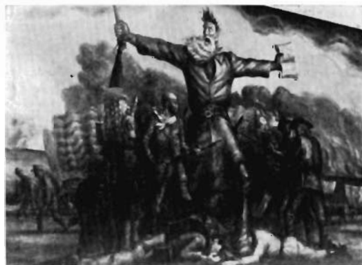
John Stewart Curry's mural of John Brown in the state capitol, aroused a furious controversy and Curry refused to sign it.

Along with the tide of veterans came a wave of immigrants from Europe. Many of these were of German ancestry although some of them came from Russia. Seeking relief from compulsory military service and freedom to practice their religious beliefs, these immigrants were guided by idealism, but they brought with them hard winter wheat and