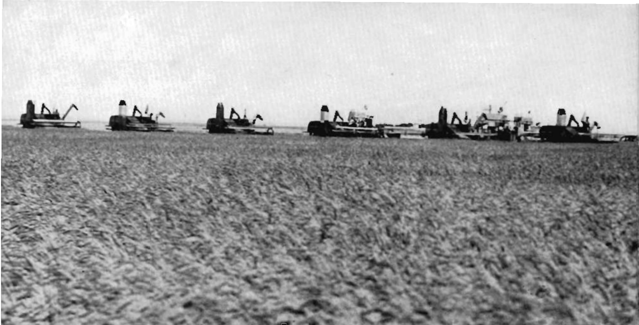
In the wealthy wheat belt of the Southwest, near Garden City, Kan., are shown combines and trucks working during harvest season. This is the phase before the grain is loaded into

the Santa Fe trail ballooned. Col. George Sibley met chiefs of the Osage tribes at Council Grove in 1825 and arranged permission for traders to cross the Osage lands. Army posts were established at Dodge City, Fort Scott and Fort Riley. With a trickle of settlers moving westward, Congress established Kansas as a territory in 1854.