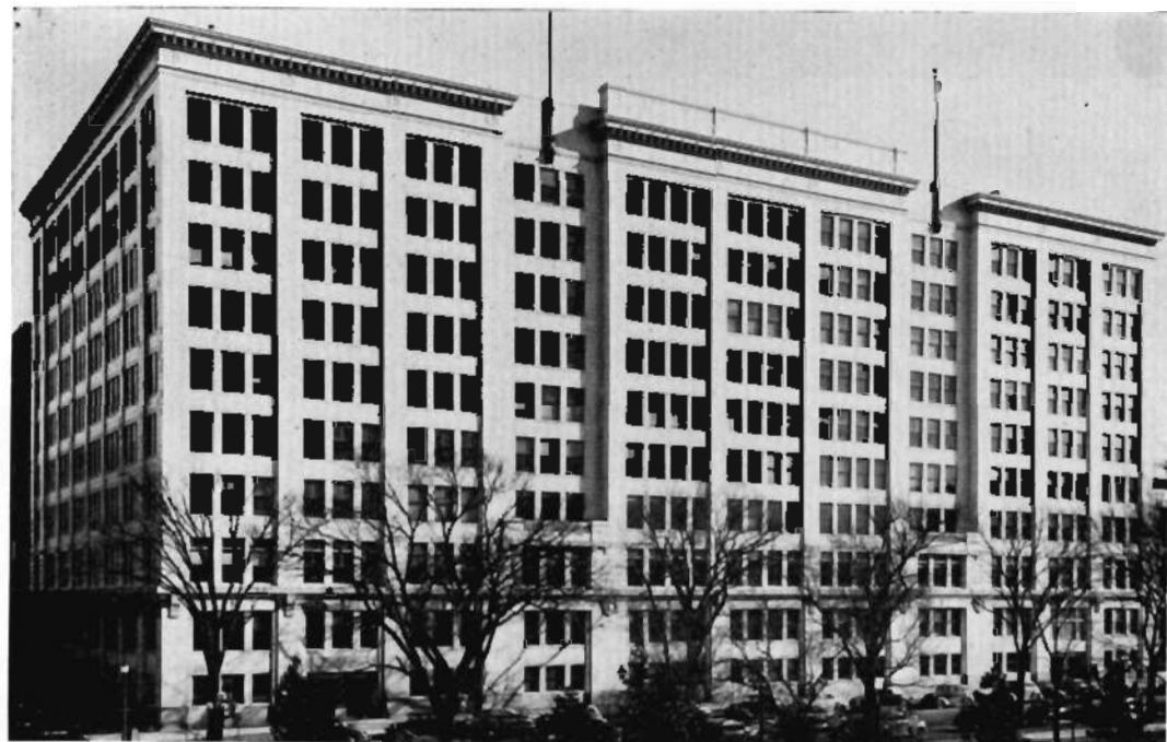
To many Santa Fe employees a description of this picture is superfluous—it shows the company's general office building at Topeka, Kan. The building was completed in 1924.

K ANSAS celebrated its 87th anniversary as a state January 29. Organized in the Kansas territory two years earlier, the Santa Fe System has a close kinship with the state, and their histories run parallel in a truly remarkable story of development.