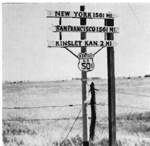
This road sign near Kinsley graphically illustrates Kansas' central location.

"There are some who profess to believe," he concludes, "that these are the birds Aristophanes described in his comedy, which, living between earth and heaven, forced tribute from both men and gods. Wherefrom it is argued that the squawking of these prairie monsters was merely a demand for tribute. Rather do I believe them to be a species of the Phoenix bird, generated in fire and brimstone, and never ceasing do I offer my prayers of thanksgiving to the Virgin, that I was delivered from their country with a whole skin."