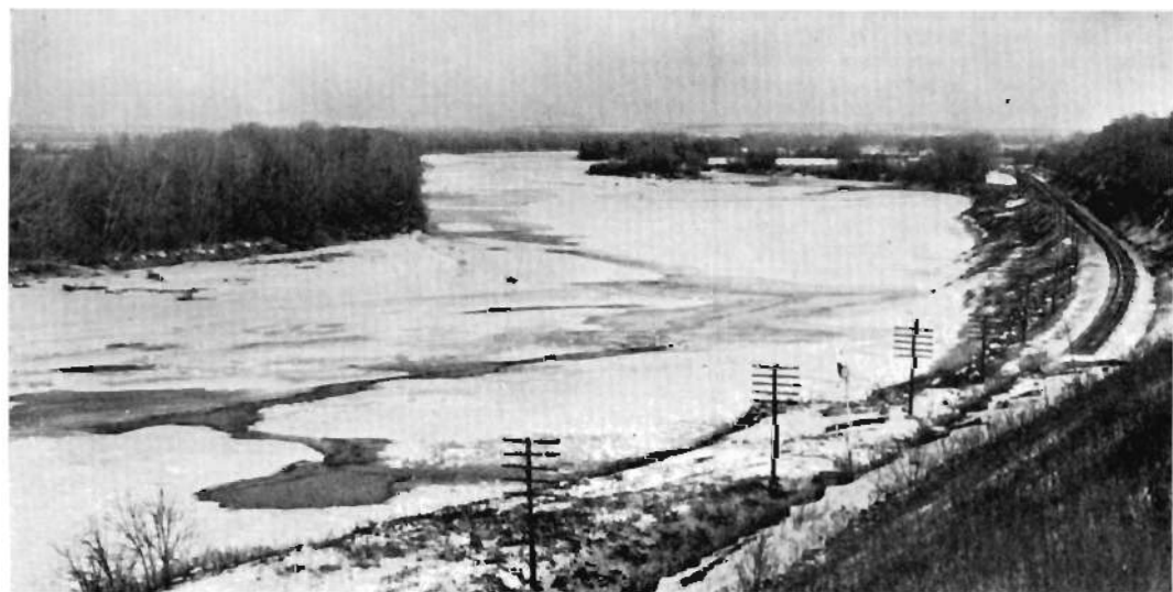
The Kaw River, Kansas' largest stream, lies ice-bound in mid-winter. This scene also shows the Santa Fe line between Topeka and Kansas City.

"However this may be," the Spaniard continues, "there is almost general agreement concerning the tail. This is quite short, being a mere tuft of feathers when these birds are in repose. But in flight or when running