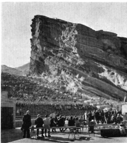
Outstanding among parks surrounding Denver is the Park of Red Rocks—Nature's amphitheater in the Rockies.

At the turn of the century, industrial leadership shifted from mining to agriculture. Six centuries ago the primitive Cliff Dwellers proved the high tablelands and moist valleys would grow produce. Colorado agriculture has marched steadily onward to reach the high