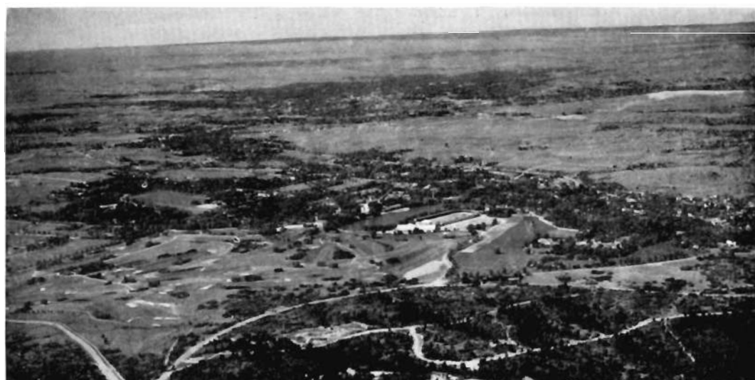
Looking for an ideal vacation spot? Here it is — Colorado Springs, Colo. — nestled at the foot of Pike's Peak and on Santa Fe's picturesque run from Pueblo to Denver. Prominent in the foreground is Broadmoor Hotel, famous the world over and meeting place of renowned leaders in all walks of life.

place it holds today, with almost four million acres of cultivated land watered by a network of ditches and canals. Only California has a larger area in irrigated farm lands.