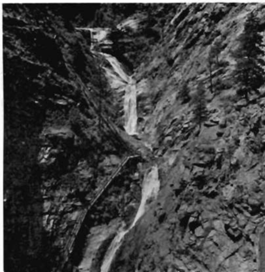
The waters of South Cheyenne Creek, near Colorado Springs, fall over the ledges of a narrow gorge in cascades known as Seven Falls. A staircase of 295 steps leads to the top for the convenience of tourists. This is one of the state's natural wonders.

Horace Greeley of the New York Tribune , for whom Greeley, Colo., was named, made a