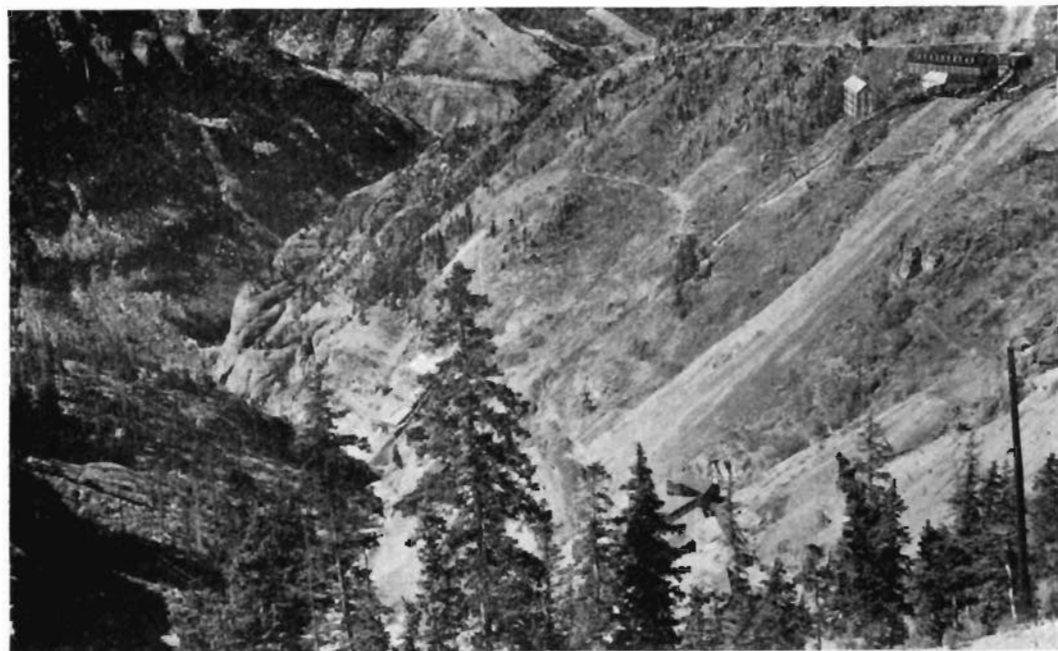
Typical of the mining camps in Colorado is Telluride, once a roaring town of 5,000 and one of the liveliest of the state's gold camps. By 1909 this district had produced more than $60 million in precious metals. The town now profits from a few gold mines still operating and from summer tourists as well as trade with nearby farms and ranches.

visit to the state in the early days and popularized with his enthusiasm the slogan: "Go West, young man; go West, and grow up with the country!"