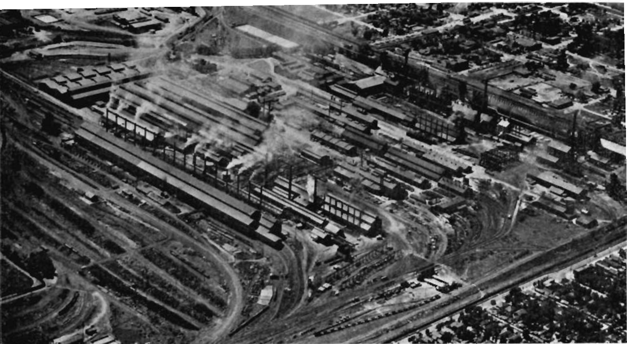
The Minnequa Steel Plant of the Colorado Fuel and Iron Corp. covers 600 acres in southwestern Pueblo. Products range from heavy steel rails to chemical fertilizers. Pueblo is Colorado's second largest city and an important division point on the Santa Fe.

been withdrawn from public entry by the Atomic Energy Commission for diamond drill tests for uranium.