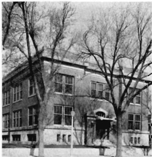
The Santa Fe General Office Building at LaJunta, Colo., situated at the corner of 4th and Santa Fe Ave. LaJunta (The Junction) marks the point where the railroad building east from Pueblo, Colo., met the crews building west from Granada, Colo., in 1876.