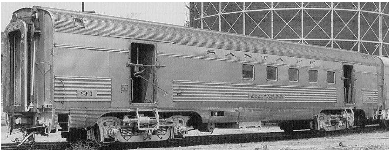
#91 at Los Angeles in 1963 with full skirt.