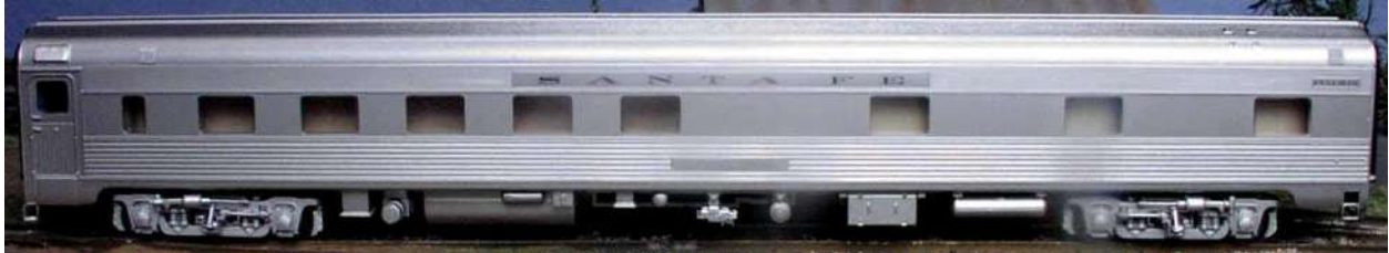
Santa Fe Pine