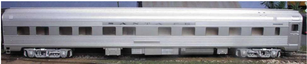
Santa Fe Pine