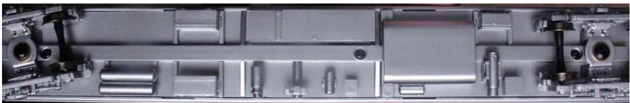
Underbody, Santa Fe Pine