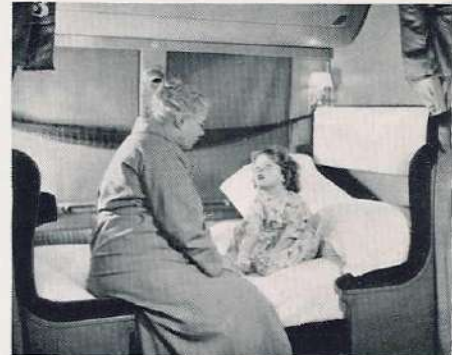
MODERN STANDARD PULLMANS

Dude Ranches in the big sun-drenched riding country of New Mexico and Arizona. Write for the Santa Fe Dude Ranch booklet, crammed with pictures, and giving locations, rates, accommodations, and other important information about scores of the summer and winter ranches along the Santa Fe.