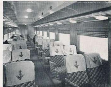
COMFORTABLE, SPIC AND SPAN COACHES