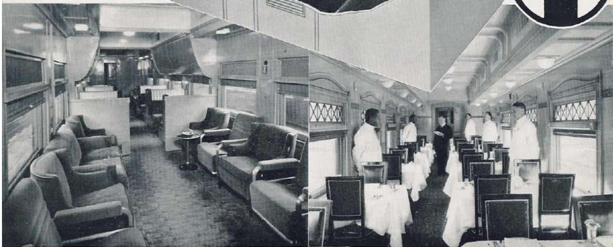
COZY CLUB LOUNGE CAR