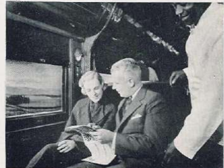
SPACIOUS TOURIST-SLEEPER BETWEEN DENVER AND LOS ANGELES