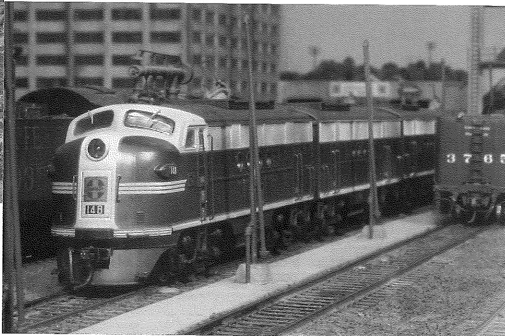
Amid modern Santa Fe steam power, FT No. 148 pauses between runs on August 4, 1952 at the Argentine engine terminal. Stewart's new HO scale models make the scene possible.

If your FT were tooling along at scale speed beneath scale blackjack pines on the way up to a simulated Arizona Divide, I don't think anybody'd notice that it was a little longer, a little wider, and a little higher than