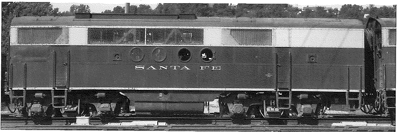
FT 146A displays the final B unit paint scheme as it makes its way east to EMD for credit on 1300 class GP35's in 1964.

The author saw a 400-class unit in Kansas about 1953 with the original "postage-stamp" nose treatment and the darker yellow. He saw a 100-class lead unit at Cleburne shops in 1953—all yellow! And he was working at the 21st Street diesel shop in Chicago in 1944 when a painter turned the passenger 1-spot all black. A few days later it was its regular aluminum, red, and yellow, and black, of course (and that unit at Cleburne certainly got its blue). The practice in both instances was to apply each color to the entire locomotive before the next color went on. 🍷