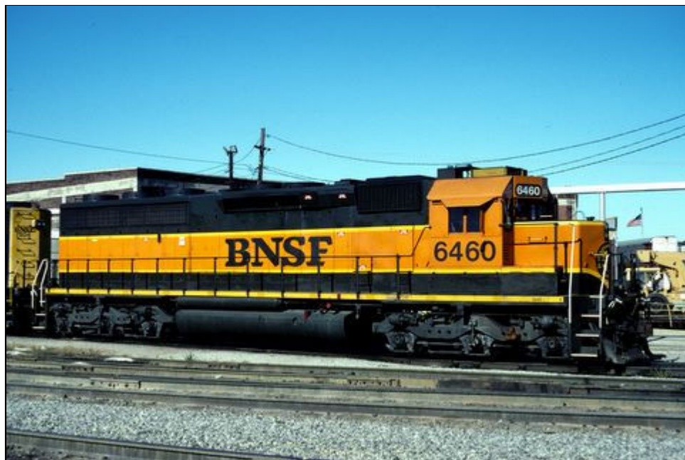
Right - BNSF SD45-2 6460, originally ATSF SD45-2 5640/SPSF SD45-2u 7210/ATSF5810, was one of two SD45-2s painted in the BNSF Heritage I color scheme. The 6460 is still on the BNSF roster. Kansas City, KS.