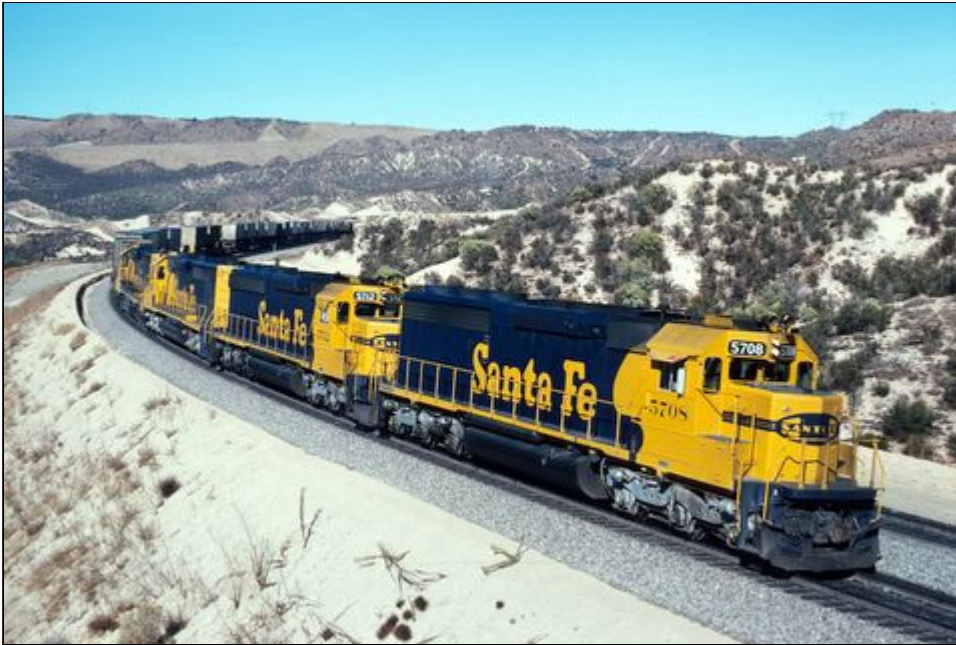
Left - ATSF SD45-2s 5708, 5712, and two other SD45-2s lead the eastbound 891 Train Super C on the south main track approaching Summit on the Santa Fe's Los Angeles Division First District. After leaving the Santa Fe roster in 1992, the 5708 went to work on the MRL and the 5712 went to work on the Trona Railway. Summit, CA 12-7-75. - Kodachrome by Ralph Back