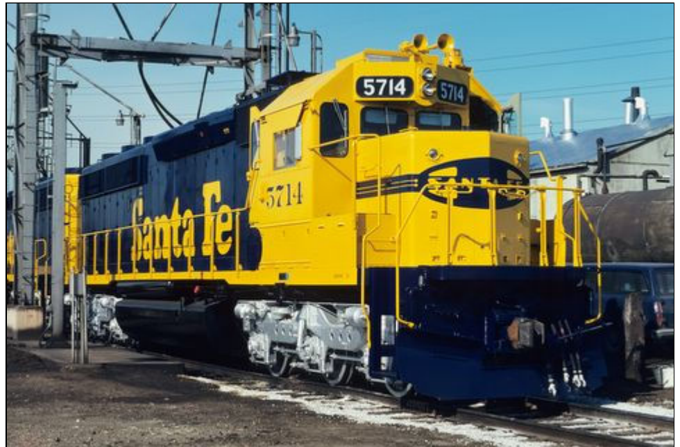
Right - ATSF SD45-2 5714 has just been delivered to the Santa Fe at Corwith Yard. The 5714 has the medium-width anticlimber with coupler lift bars with loop and silver painted trucks, and was the last SD45-2 of the third order which were leased and not owned by the Santa Fe. The 5714 has the new-style fabricated radiator intake grilles which became standard on the EMD 'Dash 2' models. Chicago, IL 6-1-74.

The third Santa Fe SD45-2 order for 10 units (ATSF 5705-5714 b/n 74603-1 to 10 b/d 5/74) was delivered in the then standard blue/yellow Warbonnet scheme with blue end-sheets and snowplow, silver painted trucks, black fuel tank, and blue medium-width front anti-climber. The medium-width front anti-climber allowed all units to be fitted with the coupler lift bar with loop. All 10 units of this order delivered with a new style vertical front and rear step hand railings; and ATSF 5706, 5707, 5712-5714 (5 units) were delivered with EMD's new-style fabricated radiator intake grilles. All units in this order delivered with Sinclair radio antenna mounted on "table" ground plane left of inertial air filter behind cab roof on engineer's side, and cab roof mounted A/C. These units became the 5705 Class after completion of the 5800 Class SD45-2u remanufacturing in March 1988. ATSF 5705-5714 were acquired on a 15 year lease agreement and not remanufactured. The lease agreement was extended until they were retired in August 1992 and returned to HELM Leasing. The 5705,5707-5709 went to Montana Rail Link as MRL 309-312 and 5710-5714 were leased to the Trona Railway as TRONA 3001-3005 (5712,5713,5710,5714,5711). Trona returned the SD45-2s to Helm Leasing in April 2004 after which time they could be found working on the Union Pacific with HLCX reporting mark.