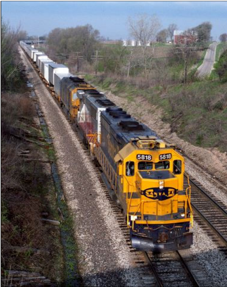
Above - ATSF SD45-2 5818 leads an eastbound TOFC train at Edelstein, IL 4-30-92; Illinois Division Chillicothe Subdivision. The 5818 was remanufactured during May 1986 from SD45-2 5682, and was originally numbered 7218 painted in the SPSF "Kodachrome" scheme. The 5818 was on the BNSF roster as BNSF 6468 until retired in February 2005.