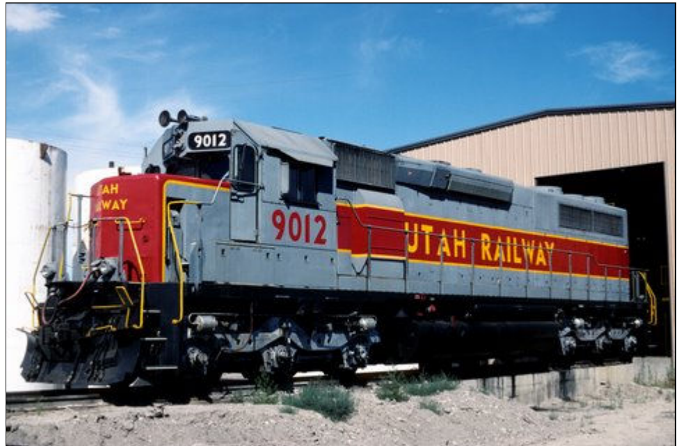
UTAH SD45-2 9012 Provo, UT

ATSF SD45-2 5855 was an experimental repowering rebuilt with Caterpillar Model 3612 4250-hp engine in July 1987 (SD CAT). This experiment was not repeated. The 5855 was sold to Morrison-Knudsen in 1993 then shipped to the Utah Railway as UTAH 9012 in August 1993. In July 1995, UTAH 9012 was returned to Morrison-Knudsen for engine work. The Caterpillar engine was removed and a standard 20 cylinder EMD engine rated at 3200 horsepower was installed in February 1996. The 9012 returned to service on Utah Railway until the lease expired in September 2001. See Roster Source 13. UtahRails.net for additional information.