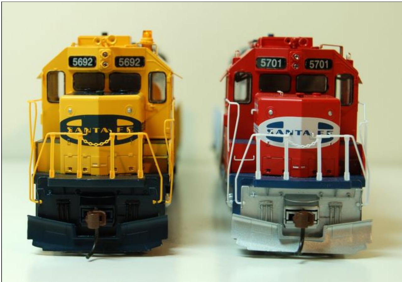
Above - Pictured here are front views of ATSF 5692 in the blue/yellow Warbonnet scheme and ATSF 5701 in the red/white/blue "Bicentennial" scheme. You can see the front anti-climbers and coupler lift bars with loop on both units which are incorrect for Santa Fe's second SD45-2 order.

Modeling the Santa Fe's SD45-2 in HO scale is made easy with the recent releases of the Athearn GENESIS SD45-2. Athearn has released the Santa Fe SD45-2 with road numbers in the first two Santa Fe SD45-2 orders. From the first order are ATSF 5631, 5648, and 5650 all w/o A/C painted in the standard Santa Fe blue/yellow pin-stripe freight scheme with yellow ends and small square Santa Fe blue/yellow circle-cross emblem centered on the end of short hood, small tapered front anti-climber with drop-step, black trucks, fuel tank, end sheets and snowplow. From the second order are ATSF 5692, 5698, and 5699 painted in the blue/yellow Warbonnet scheme with dark blue Santa Fe cigar-band herald centered on the end of short hood, silver painted trucks, all yellow hand railings and stanchions, blue anti-climber end-sheets and snowplow, and black fuel tank; and ATSF 5700 and 5701 painted in the red/white/blue "Bicentennial" scheme with the United States Presidential seals mounted on the hand rails behind the cab on both sides of the model, and equipped with Xenon strobe-lights on both sides of the cab roof.