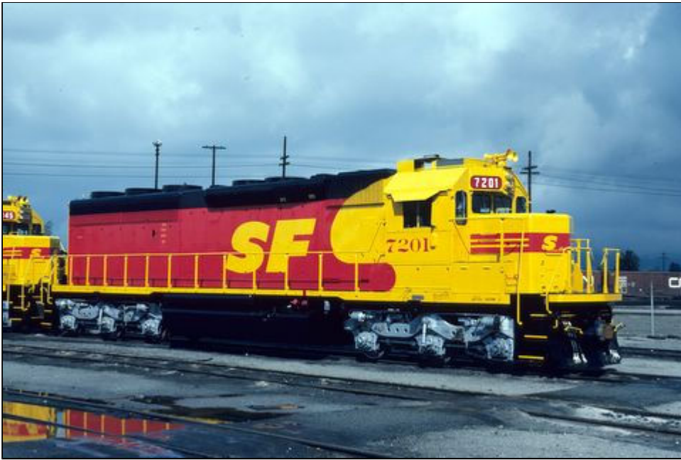
Left - Just released from remanufacturing, SPSF SD45-2u 7201 was remanufactured from SD45-2 5681 from the second order, and now has Sinclair radio antenna, and no nose classification lights. SPSF 7201 was renumbered to ATSF 5801 and was on the BNSF roster as BNSF 6451 until retired in December 2002 and sold to NRE. San Bernardino, CA 2-15-86.