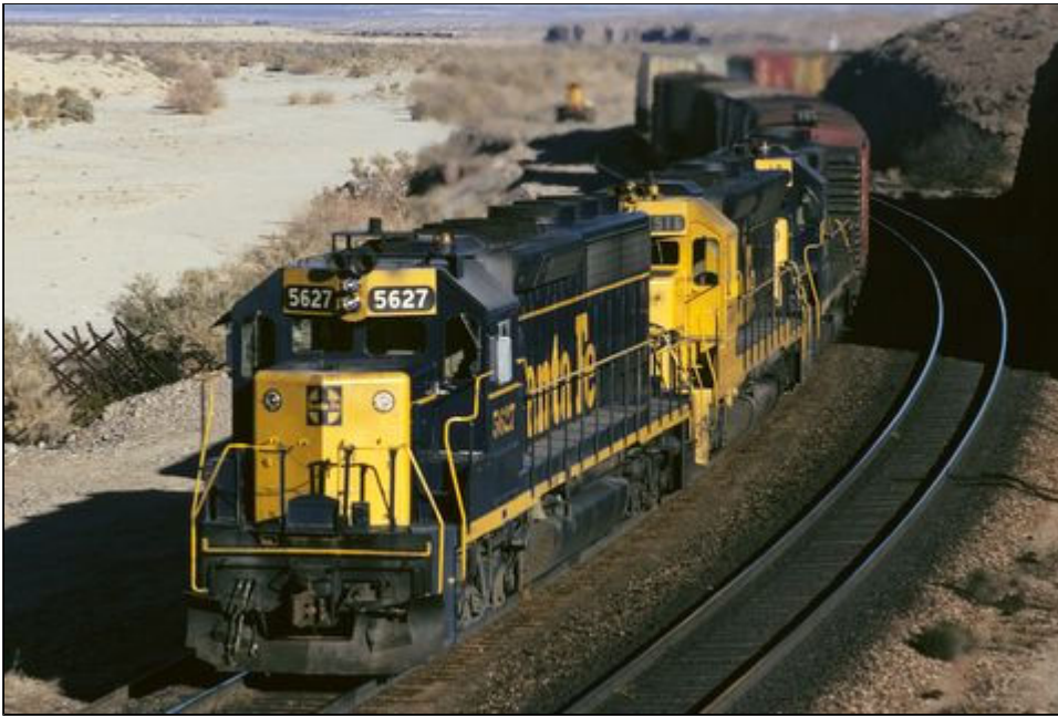
Left - ATSF SD45-2 5627 displaying its as delivered appearance in the then standard blue/yellow stripe scheme with dark blue Santa Fe cross herald. The 5627 was one of the units delivered without air-conditioning, and now has its horn mounted low at roof top level. ATSF 5627 was remanufactured to ATSF 5857 in April 1987 and was on the BNSF roster as BNSF 6506 until retired in May 2002 and sold to NRE. Ibis, CA 1-27-74.