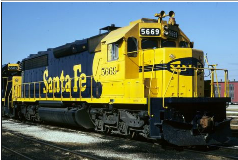
Left - ATSF SD45-2 5669 is three months old displaying its as delivered appearance in the blue/yellow Warbonnet scheme. The 5669 was the first SD45-2 remanufactured in February 1986 to SPSF SD45-2u 7200 and later renumbered 5800. You can see the small air vent mounted vertically on cab side below the front of cab window on engineer's side which caused the unit number to be noticeably off center. ATSF 5800 is on the BNSF roster as BNSF 6450. Corwith - Chicago, IL 9-1-73.