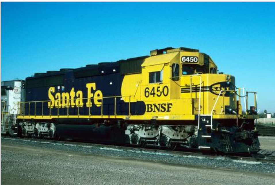
Left - BNSF SD45-2 6450, originally ATSF SD45-2 5669/SPSF SD45-2u 7200/ATSF 5800, is typical of the BNSF renumbering patch; and has white step edges and white front and rear step hand rails, a BNSF modification. Riverbank, CA 2-8-03.