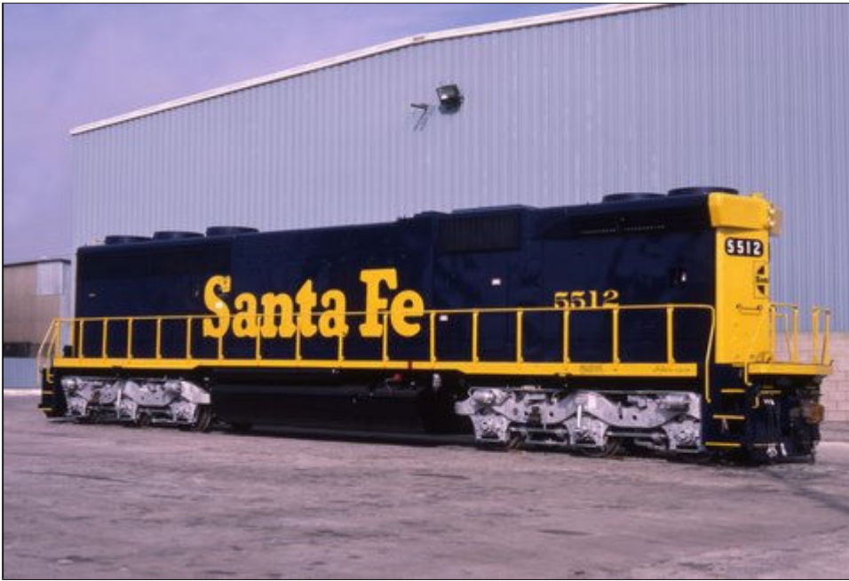
Left - Fresh from remanufacturing, ATSF SD45-2B 5512 was remanufactured from ATSF SD45-2 5703 one of the Santa Fe SD45-2s that wore the "Bicentennial" paint scheme. The 5512 has the yellow Santa Fe cross herald on the designated front, and was on the BNSF roster as BNSF 7506 until renumbered 6522 in November 2006. San Bernardino Shops, CA 10-87.

ATSF SD45-2s 5651,5676,5703,5626,5701,5633,5684,5700 were remanufactured to eight SD45-2B cabless units and renumbered 5510-5517 in the 5510 Class by the Santa Fe at the San Bernardino, CA shops between September 1987 and January 1988. The short high hoods were fabricated in the San Bernardino shops. ATSF SD45-2B 5510 had its dynamic brake grids in the standard location over the engineroom, 5511-5517 had the dynamics over what had been the short hood which would allow for cooler operation.