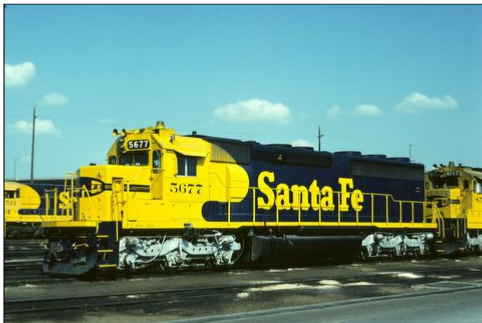
Right - ATSF SD45-2 5677 has been repainted and now has yellow step edges and yellow front anti-climber, "Santa Fe" lettering style, and silver painted trucks. The 5677 was remanufactured to SPSF SD45-2u 7208 in March 1986 and later renumbered 5808, and is on the BNSF roster as BNSF 6458. Kansas City, KS 9-4-78.