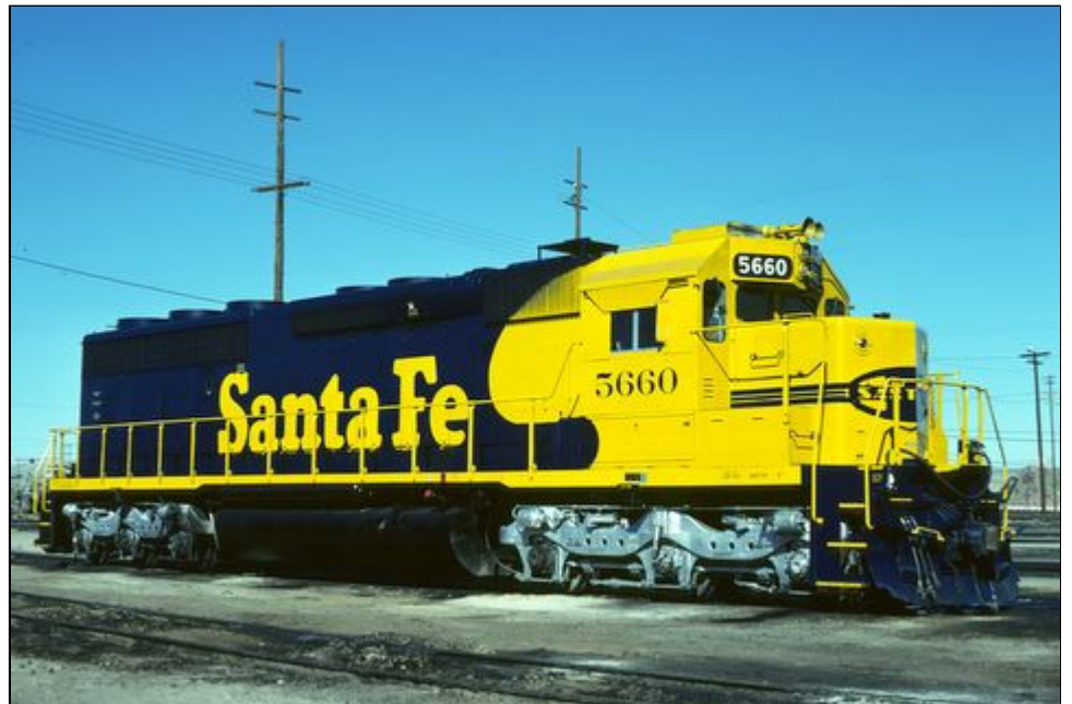
Right - ATSF SD45-2 5660 has been repainted from its as delivered blue/yellow stripe scheme to the blue/yellow Warbonnet scheme with "Santa Fe" lettering style, yellow step edges, and now has a Sinclair radio antenna and coupler lift bars with loop. The 5660 was one of the six units from the first order delivered with A/C. Note the louvers on the front cab wall below the window. The 5660 was remanufactured to SPSF SD45-2u 7204 in March 1986 and later renumbered 5804, and was on the BNSF roster as BNSF 6454 until retired in July 2002. Barstow, CA 2-20-78.

The first Santa Fe SD45-2 order for 37 units (ATSF 5625-5661 b/n 7391-1 to 37 b/d 5/72) was delivered in the then standard blue paint with yellow trim, black end-sheets and snowplow, yellow hand rails and blue vertical hand rail stanchions, and dark blue Santa Fe cross herald centered on end of short hood; all later repainted to blue/yellow Warbonnet scheme with silver painted trucks.