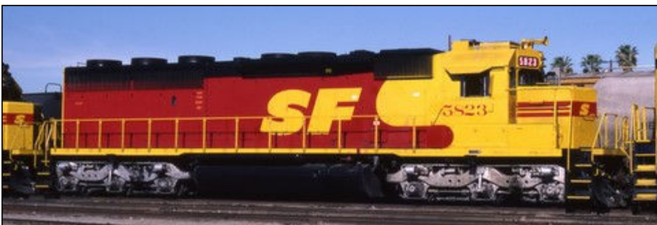
Left - ATSF SD45-2u 5823 was renumbered from SPSF 7223 and was remanufactured from SD45-2 5695 in June 1986. The 5823 is on the BNSF roster as BNSF 6473. San Bernardino, CA 1-25-87.