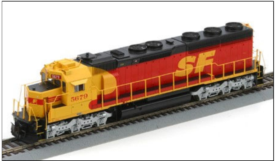
Athearn GENESIS ATSF SD45-2 5679

Athearn has announced the Santa Fe SD45-2 in the GENESIS series painted in the SPSF "Kodachrome" scheme for un-rebuilt SD45-2s road numbers 5679, 5682 and 5709 for September 2007 release.