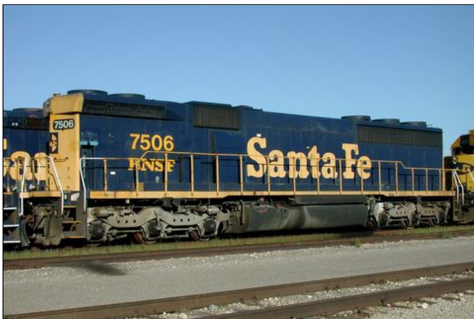
Left - BNSF SD45-2B 7506, originally ATSF SD45-2 5703/SD45-2B 5512, is typical of the BNSF SD45-2B renumbering patch. BNSF 7506 is shown in the surge fleet storage line, and is one of the last four SD45-2Bs still on the BNSF roster but now numbered 6522. Northtown, MN 8-22-02.

On December 31, 1996, the Atchison, Topeka and Santa Fe Railway Company and the Burlington Northern Railroad Company were merged into the Burlington Northern and Santa Fe Railway Company (BNSF). Today it's the BNSF Railway Company. The ATSF SD45-2 5800 Class (67 units - ATSF 5800-5854, 5856-5860, 5862-5868) was renumbered to the BNSF 6450-6516 number series. All renumbered BNSF with large blue numbers on cab sides and patched with BNSF logo below the cab number like BNSF 6450/ATSF5669/SPSF7200/ATSF5800; and a small blue BNSF logo and unit number were applied to each side of the long hood end with the old ATSF number above the headlight painted over. BNSF6460/ATSF5640/7210/5810 and BNSF6481/ATSF5662/5831 were painted in the BNSF Heritage I scheme. BNSF 6481 was retired in December 2002, sold to NRE and leased back to the BNSF as NREX 6481.